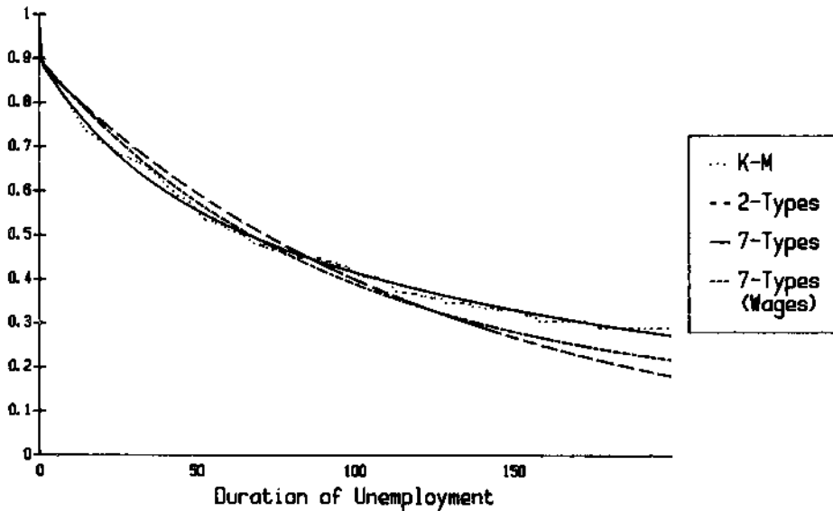
FIGURE 1.—Survivor functions: unrestricted models.

function for n = 1 and 6, along with the Kaplan-Meier estimate. The fit is clearly superior for n = 6 . As another indication, we calculated the \chi^2 statistic for the comparison of predicted frequencies of unemployment durations and actual frequencies. Because there are many empty cells (out of the 213 periods there are 101 empty cells, periods in which no individual completed a spell), we calculated the \chi^2 statistics in Table V using the classification scheme shown in Table III, approximately quarterly periods. 16 Although none of the specifications have \chi^2 statistics below the critical value, the ordering is as suggested by the likelihood values and by the plot of the survivor functions. The second column of Table V considers the fit only for the first 50 weeks, taken individually, in which there are no empty cells. Again, none of the specifications pass the fit test; the ordering is consistent with the likelihood values.